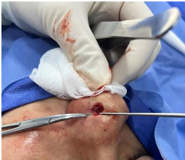
Figure 3A: Clinical images; during the surgical procedure where the tensors thread is located.

The patient attended the follow-up two months later, finding a scar with no signs of recurrence of the resected lesion ( Figure 3C ). Pathology of the lesion reported loss of adnexal structures and an intense infiltrate of an acute suppurative nature and more peripherally a chronic granulomatous one with gigantocellular reaction of the foreign body type, as well as some fibrosis and collagen homogenization with verticalization of vessels that configure a repair process. No malignancy or other types of findings were documented.