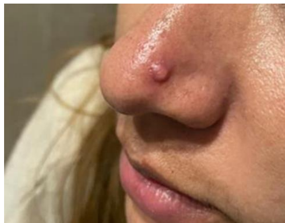
Figure 1A: It is the initial clinical image of the patient with a nodule on the nasal dorsum with intermittent purulent discharge after two years of evolution.

referred to as a suture. Questioning the patient once again, she mentioned that two years before the onset of the symptoms, she underwent rhino moderation with CARA® PDO Thread (polydioxanone) tension in a beauty clinic by non-dermatologist personnel, and with this information, we decided to request a high-resolution ultrasound to rule out a fistulous tract. Ultrasound was performed with a linear 18 MHz transducer and showed a hypo echoic solid nodule with poorly defined, irregular borders measuring 6.6 × 6 × 6.7 mm, with a foreign body