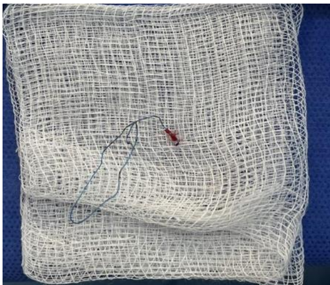
Figure 3B: Specimen resected with the tensor thread.