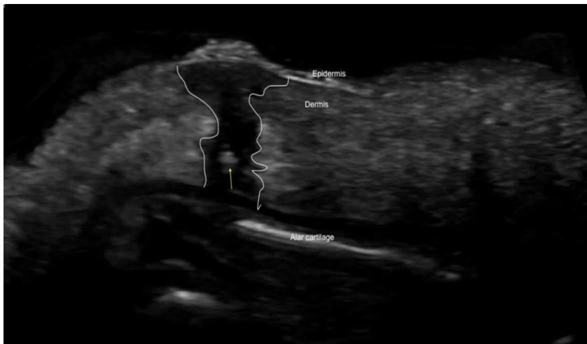
Figure 2A: High resolutions ultrasound, a grey-scale longitudinal view of the dorsal nasal area, shows between the line a hypoechoic , longitudinal, , irregular lesion that extends from the epidermis to the alar cartilage, inside the lesion the yellow arrows show a linear hyperechoic image corresponding to a foreign body.(tensor thread)

Image matching with foreign body granuloma (suture) and possible changes of telangiectatic granuloma ( Figure 2 ).