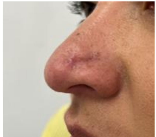
Figure 3C: Clinical image of the patient two months after the successful surgical procedure