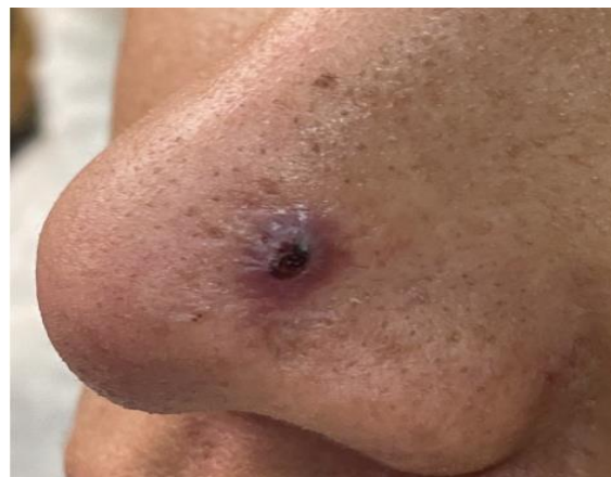
Figure 1B: It is the reappearance of the lesion after the first surgical intervention in the same area and the persistence of serohematic secretion.