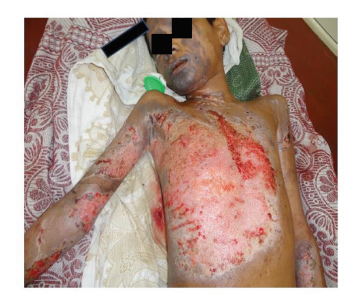
Figure 4: Chemical burns.