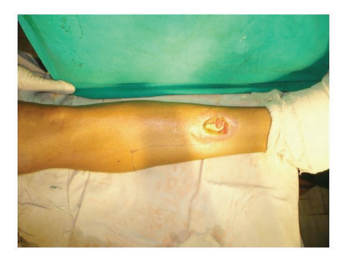
Figure 3: Electrical burns and exposed tibia.

ductivity, reduced competitiveness, employee rehiring and retraining, as well being subject to increases in workers' compensation premiums.