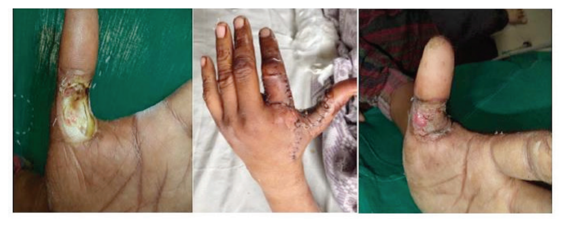
Figure 6: First dorsal metacarpal artery flap for volar defect thumb (Proximal phalanx).

In India the epidemiological data on the occupational injury and mortality is very scanty. Our analysis attempts to study the patterns and causative factors of