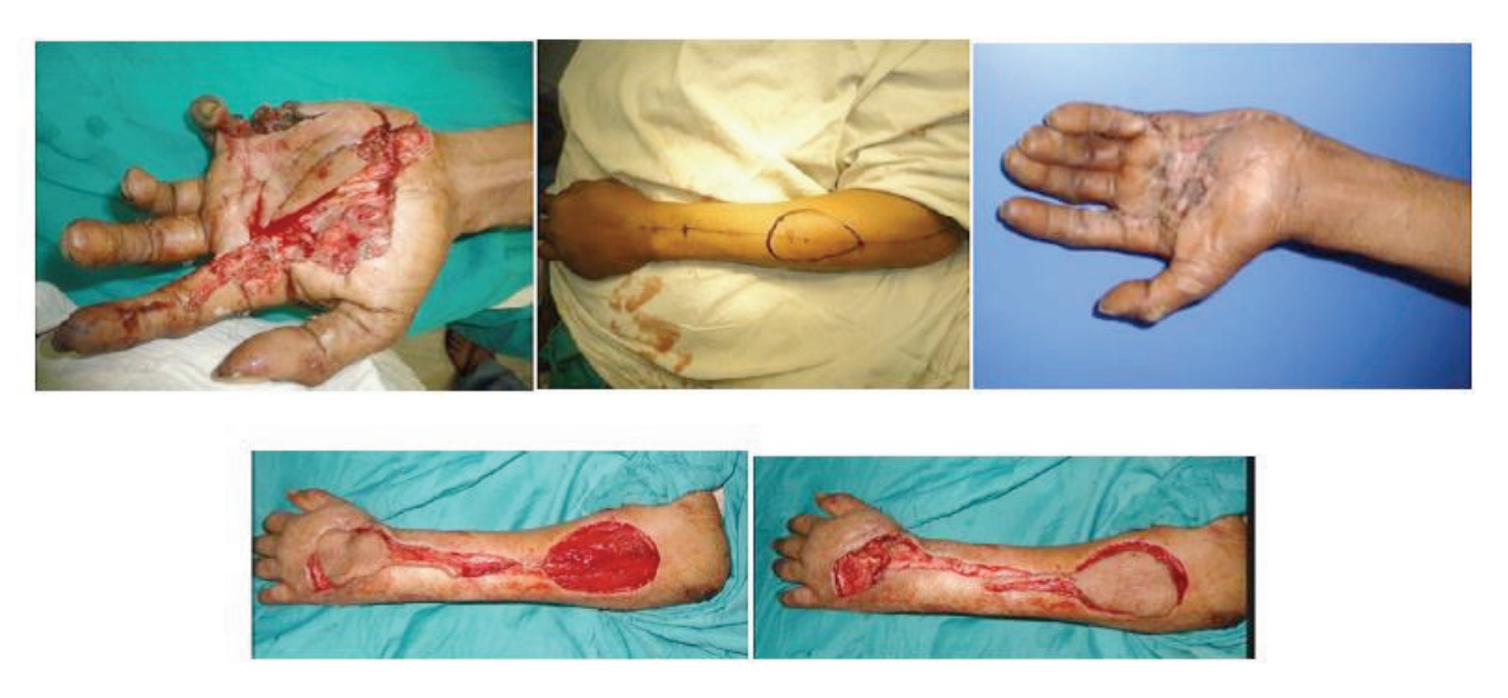
Figure 8: Posterior interosseus artery flap for defect dorsum of hand.

industrial emergencies reported to department of plastic surgery at Gangamai hospital, Sholapur. Age and sex are the most important determinants of injuries. In the study majority of the accidents occurred among males i.e 224 (88%), with male to female ratio 7: 1. Similar findings were reported in a study conducted in Australia where Male: Female ratio was 6:1 [12]. One reason for